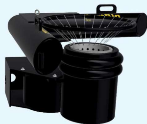
PortBin Tide Shallow Weight 80 kg Collect 30 l 900 1500 1500