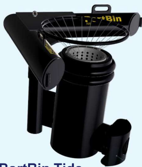
PortBin Tide Weight 80 kg Collect 30 l 1200 1500 1500